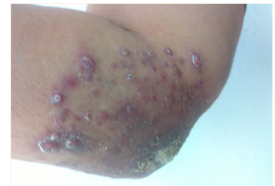
Figure 1. Right elbow in flexion: multiple papules and pseudo-vesicles in a lineal pattern.

The somatic examination showed multiple papules and pseudo-vesicles in a lineal pattern (Figs.1 & 2) around a main ulcero-crusted lesion (Fig.3) in the right elbow without other anomalies. The basic biology tests were within normal limits.