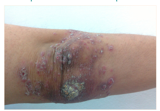
Figure 3. Right elbow in extension: the main ulcerocrusted lesion with multiple satellite lesions.

The diagnosis of CL was confirmed by the detection of Leishmania amastigotes in smear from the ulcerocrusted lesion.