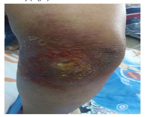
Figure 4. Lesions after one week treatment.

The patient was treated with intramuscular meglumine antimoniate at the dose of 60 mg/kg/day for two weeks with favorable evolution: progressive disappearance of the satellite lesions from the tenth day of treatment ( Figs.4 & 5 ) and their complete disappearance and healing of the main lesion on the fifteenth day ( Fig.6 ).