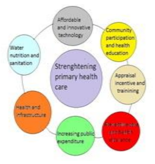
Fig2. The Wheels of Primary Health Care [17]

WHO identified three basic goals of PHC and these are good health to the populace, fair financial contributions and responsiveness of these health care providers. These goals determined rendering of efficient health services, resources generation such as health care financially (raising, pooling and allocating) health instrument such as materials resources and stewardship such as human resources [15]. PHC was meant to tackle the main health problems in the community – providing promotion. preventive, curative, and rehabilitative services as appropriate and also to provide education on prevailing health problems [16], vis-a-vis serving as a central hub (Fig 2)