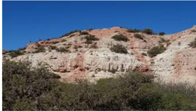
Peñas Blancas (HUMAHUACA) the archaeological site, provenance of the two snuff trays