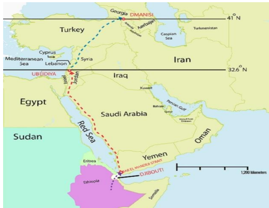
Figure 4. Close-up view of the Middle East route taken by H. erectus hominins (1.8 – 1.6 mya) after migrating over the Bab el Mandeb-land bridge at a time of lower sealevel during the Pleistocene Epoch, followed by their northward migration along the western coastline of the Arabian Peninsula, and then up to Ubeidiya, Israel, and further northward to Dmanisi, Georgia. The optional route where hominins elected to take when they were within the southern part of Eurasia is not shown in this figure but is shown in Figure3.

followed by relocating much farther north to Dmanisi, Georgia [19, fig. 3.10] (Fig. 4). This was besides one other optional route chosen by other H. erectus hominins once they were on the Arabian Peninsula who headed towards the Far East, ca. 1.8 – 1.6 mya [24] (Fig. 3).