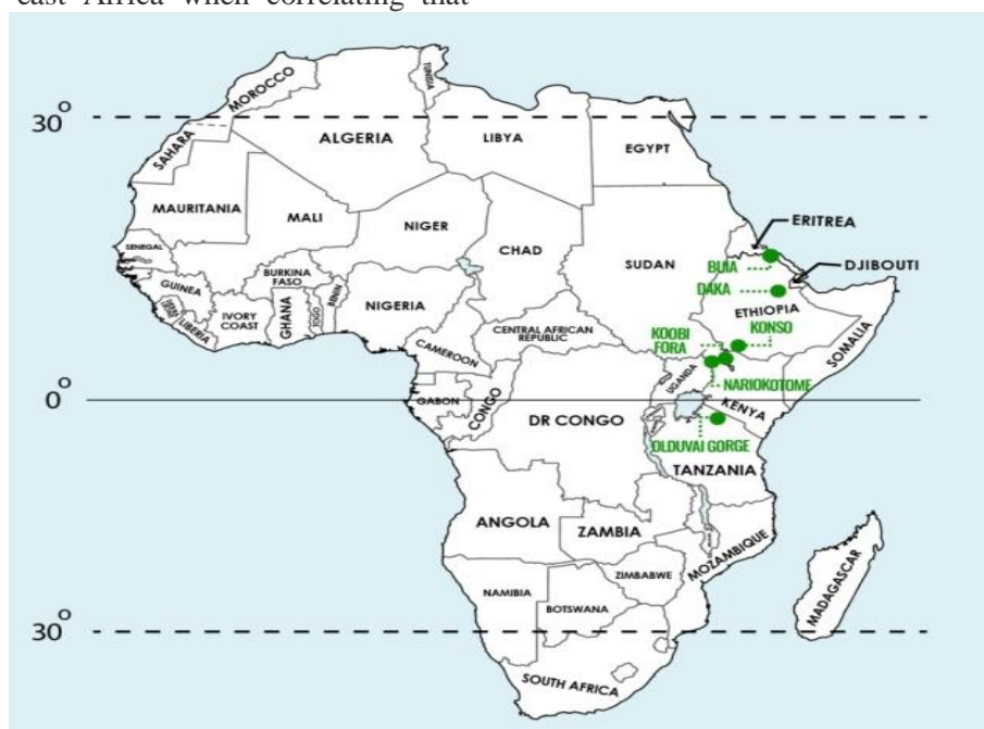
Figure 5. The presence of all H. erectus ' archaeological sites in east Africa that prove the existence of hominins both within and adjacent to the Horn of Africa (encompassed by Djibouti, Eritrea, Ethiopia and Somalia) not

with the southeasterly trade wind direction (Fig. 2). Likewise, any hypothetical, H. erectus hominins living in central Africa would be forced to move to east Africa because of northeasterly trade winds advancing, hypothetical fires (Fig. 2). In both of the preceding, two cases, the interpretation is, that the remaining amount of H. erectus hominins surviving in east Africa were paleo-positioned behind the advancing, rapid fires while they only had to worry about the very slow, backward progress of paleo-fires which was previously discussed (superimpose Figure 2 over Figure 5). The study considers that particular area of east Africa as a “pocket” of temporary safe refuge (refugium) since those H. erectus hominins were “behind” the hypothetical, rapid, forward advancing, paleo-fires mobilized by wind. Thus, the previously-mentioned “hurried departure” of the hominins from Africa (1.8 – 1.6 mya) was most probably triggered by a very abrupt or “fast” environmental condition such as the widespread, mobilized wildfires because an immediate disintegration of the hominins’ edible vegetative food would have forced constant emergency conditions that prompted an urgent, hominal escape from it. Also, it becomes clear that the “hurried departure” from Africa by hominins was not caused by climate such as a gradual increase in aridity because then only a corresponding, gradual exit by the hominins from Africa would have been induced.