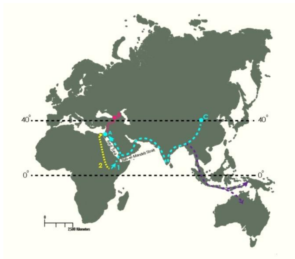
Figure 3. Map of general paleo-migrations by H. erectus within Africa and Eurasia, ca. 1.8 – 1.6 mya. The map shows routes indicated by a starting point (No. 1) and a blue-dashed arrow up to point A; and a red-dotted line up to point B taken by hominins once they exited Africa and entered Eurasia. The migration within Eurasia also includes an optional route taken by hominins in a direction towards the Far East (blue-dashed line), which either further diverged towards the far north in China (point C), or towards the south within the land areas of the Pacific Ocean (purple-dashed arrows). The map also shows an alternate, northerly route (No. 2 and a yellow-dashed arrow) taken by hominins while within east Africa which was favored by other investigators and is known as the NDR (see text). A detailed look at H. erectus ' journey up north once he was in Eurasia is shown in Figure 4. No. 1 = somewhere in east Africa; No. 2 = somewhere in east Africa. Point A = Ubeidiya, Israel;

enormous, continental glacial ice growth occurring with tectonic fluctuation that created a temporary land bridge linking the Horn of Africa to neighboring Eurasia which is presently the southwestern end of Yemen on the Arabian Peninsula [20; 21; 19]. Petraglia [22] questioned the validity of a temporary land bridge existing there in the past, but Whalen and Schatte [23] nullified Petraglia [22] by citing a coincidental, archaeological site containing hard evidence of both Olduwan and Acheulean cultures located just past the east end of the Bab el Mandeb Strait on the Arabian Peninsula, 25 – 40 km inland.