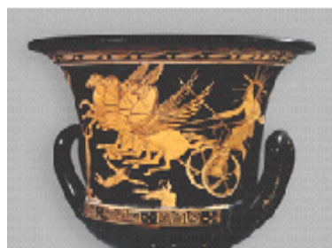
Figure1. Depiction of the Sun god Helios, with the aureole of the Sun, riding a quadriga of four winged steeds. (Attic red figure, side A of a calyx crater, dated in the High Classical Period, ca. 430 B.C. Collection of the London British Museum, London E 466, Trus-tees of the British Museum).

In Figure 1 Helios drives his chariot in full glory over the sky. We emphasize that Helios appears depicted not at sunrise or sunset, but in the middle of the day, shown in its full glory. This observation plays a crucial role in our study.