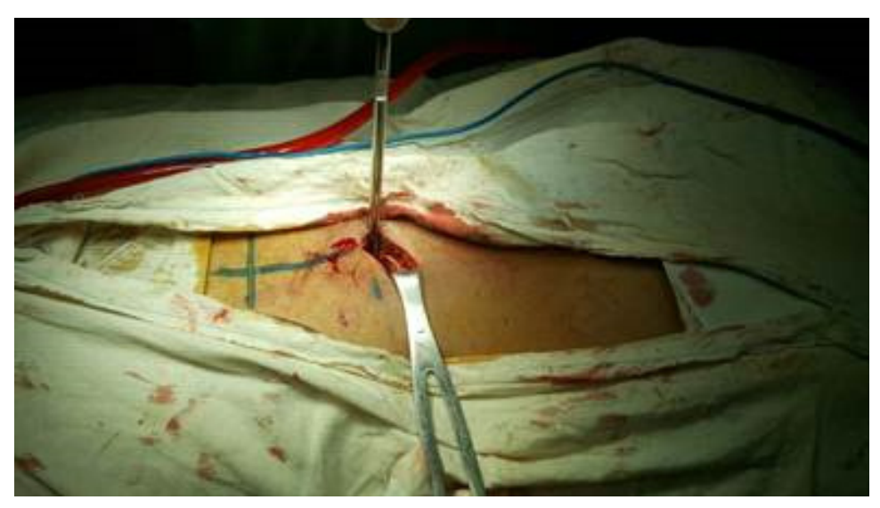
Fig 2. One Level Above and below the Fractured Vertebra was Incised and the Length of the Incision was About 2 Cm.

Incision: two small a posterior midline incision at the target segment at the level of target pedicles determined by C-arm. The length of the incision is about 2 cm, one level above and below the fractured vertebra is exposed. (FIG. 2).