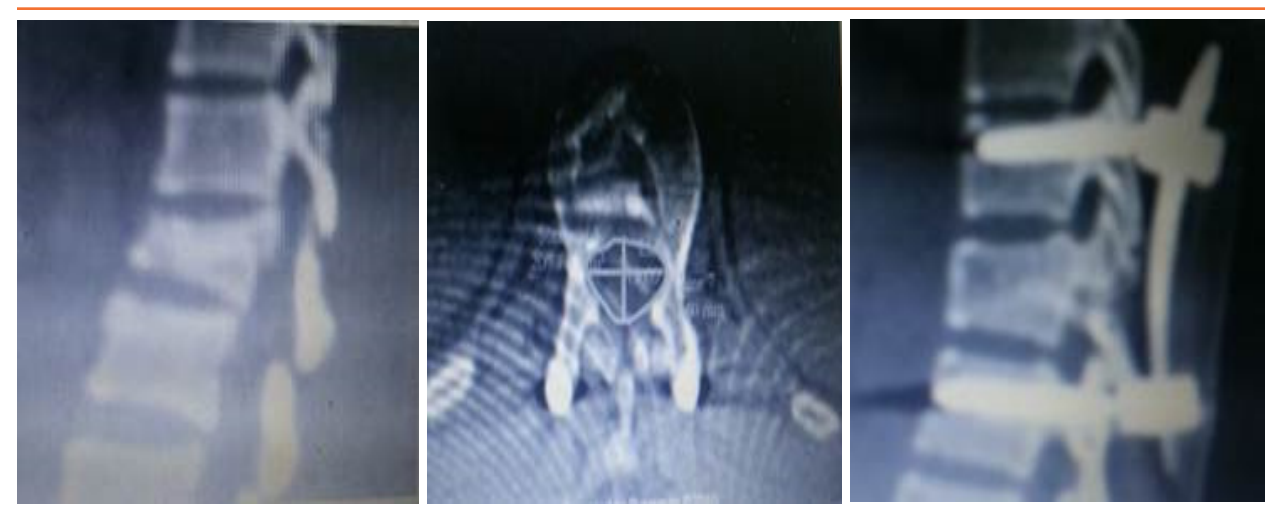
Fig 8. (A) Preoperative Kyphosis Evaluation by Ct & (B) Post Operative Ct Diameter of Spinal Canal, (C) Post Operative Kyphosis Evaluation