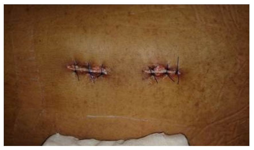
Fig 9. Sutures at the End of Surgery

The study parameters included operative time, blood loss, postoperative drainage, postoperative hospital stays, X-ray exposure time, kyphotic angle, visual analog scale (VAS) scores, postoperative complications, and accuracy rate of screws and cosmetic appearance ((Fig 9). Clinical outcome was classified according to modified Mac nab criteria (9)