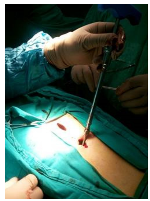
Fig 4. Insertion of the 4 Pedicular Screws

After application of the 4 screws (fig.4), a contour rod is pass (fig.5) sub muscular position with minimal manipulation, essentially no muscle dissection, and without the need for direct visual feedback