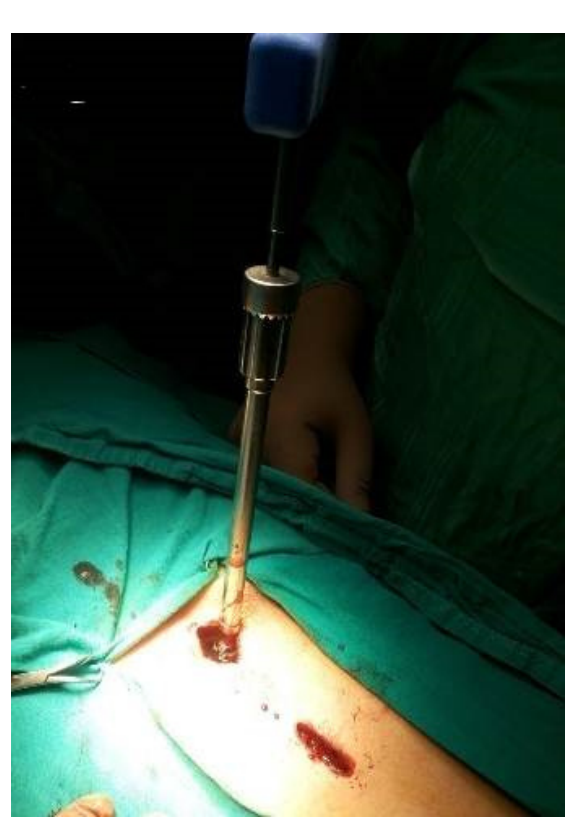
Fig 6. Application of the Nut

Application of distraction by distractor and distraction was done until correction of vertebral height if possible guided by C arm control .The correction maintainedby tightening screws head nuts (fig 6&7)