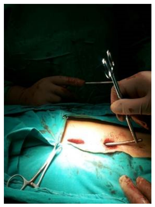
Fig 5. A Contour Rod is Pass Submasculare