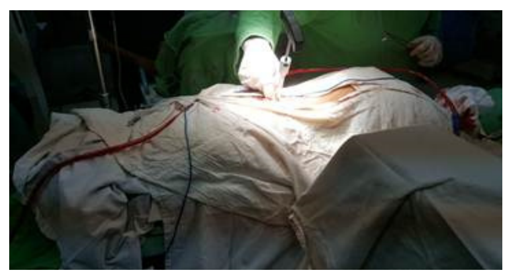
Fig 1. Patient Positioning Similar to Conventional Open Approach with Adequate Padding at Areas of Contact (Elbows And Knees) to Avoid Pressure Sores.

Hips and knees were moderately flexed to prevent stretching of the nerve roots. Then, sterilization and draping were done. (Fig, 1)