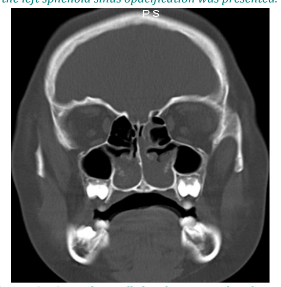
Figure 3. Coronal maxillofacial tomography showing the sparing of bilateral maxillary sinuses has been demonstrated.