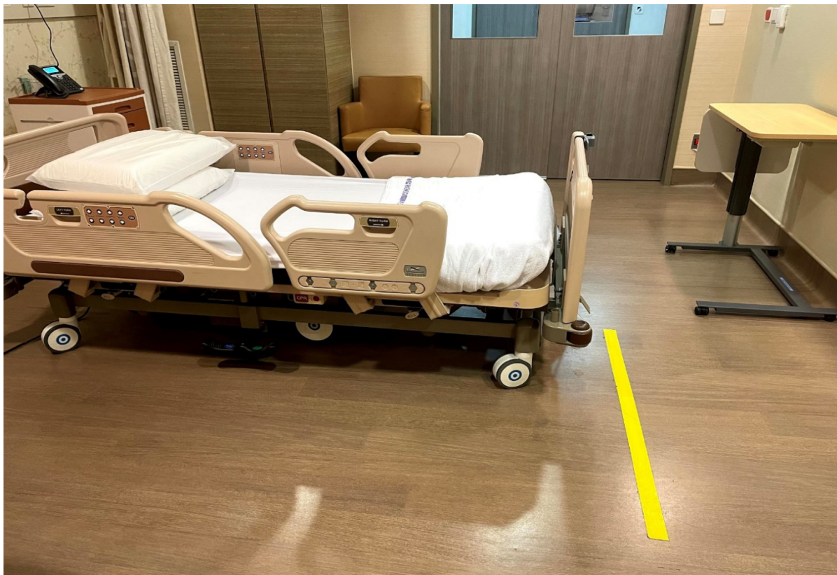
Figure4. Yellow line drawn on the floor for bed's location