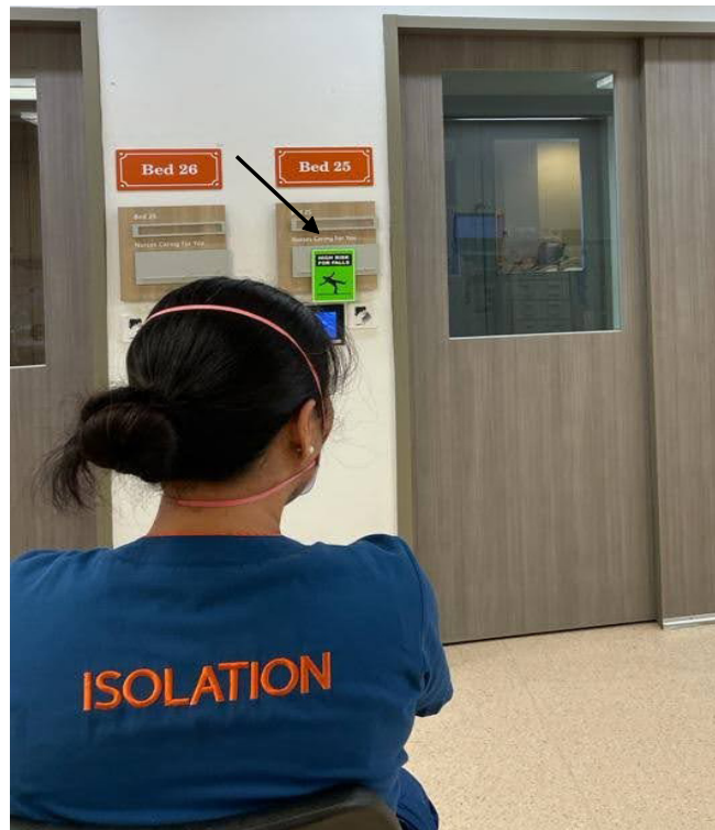
Figure3. Nurse in charge sitting outside and Green card (Arrow) indicating high fall risk