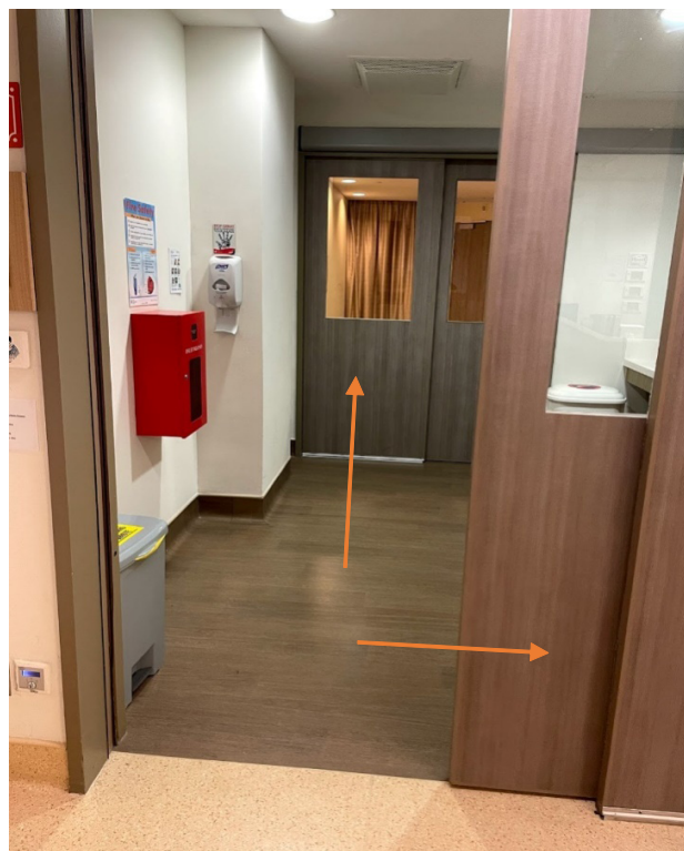
Figure2. Double doors to maintain negative pressure