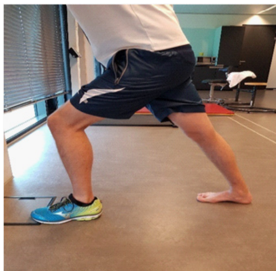
Appendix, Fig A: Gastrocnemius / Achilles stretch (right leg, barefoot), criterion for normal value = maximal angle compared to a vertical line: 70 degrees or less.