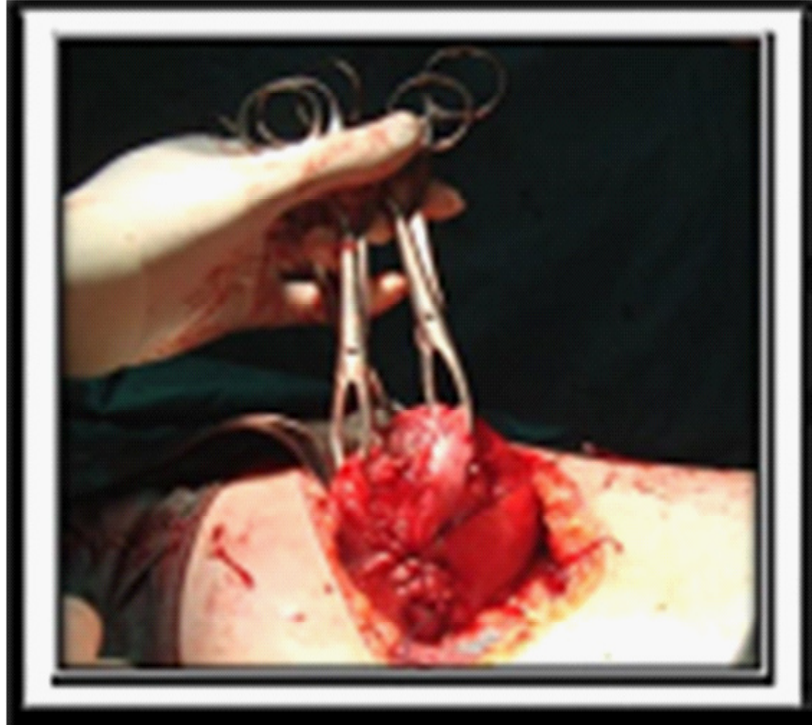
Figure 2. Transversal fundal hysterotomy.