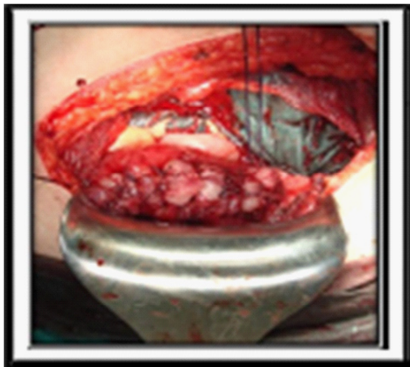
Figure 3. Transversal fundal hysterotomy closed