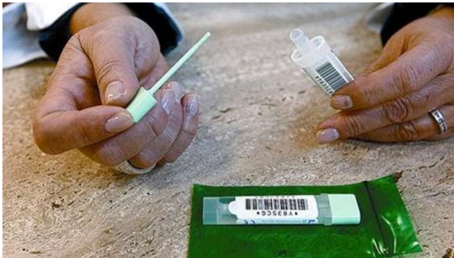
Image 2. FIT test.

The population-based Basque Colorectal Cancer (CRC) Screening Programme started in 2009 with a biennial immunochemical quantitative test (FIT)(Image 2). A complex and multidisciplinary coordinating office selected the target population; individuals with a previously-diagnosed CRC, terminal illness and reported colonoscopy in the past five years were excluded. The population target of 586,700 residents was from 50 to 69 years old and the total coverage was reached at the beginning of 2014.