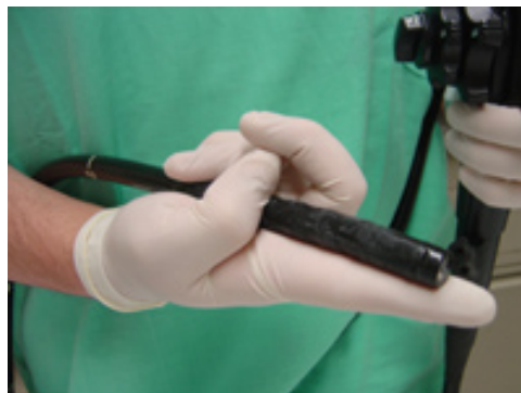
Image 3. Flexible Colonoscope.

The coordinating office individualized posts invitations providing information about the Programme (fig 1). After 6-8 weeks from the initial invitation, the kit (FIT) is sent along with instructions and individualized bar