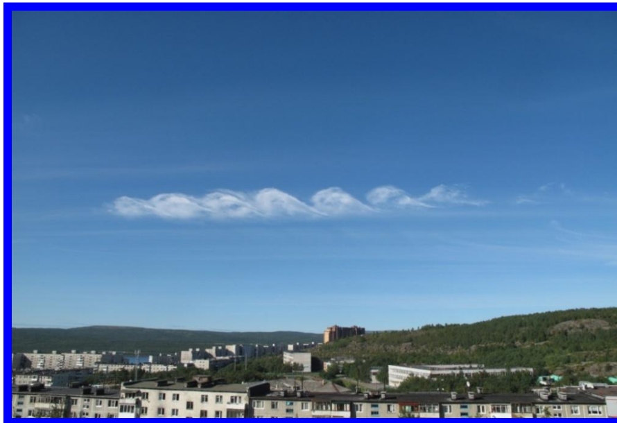
Figure3. The original photo made by the Author himself in front of his own flat on the 9-th floor in Murmansk, on September 3-d, 2017 at 11A.M., Sunday.