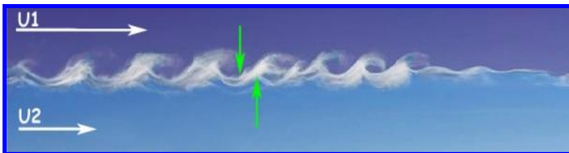
Figure3. The elementary diagram of Kelvin - Helmholtz instability in the atmosphere