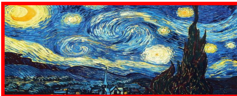
Figure1. Vincent von Gogh’s “Starring night”, the Holland postimpressionist’s “hit”. My wonderful introducing with the Kelvin-Helmholtz Instability at the environment.

My Sunday morning on September 3-d, 2017 in Murmansk has begun as usual at 11 A.M. with careful observation of the “picture” in front of