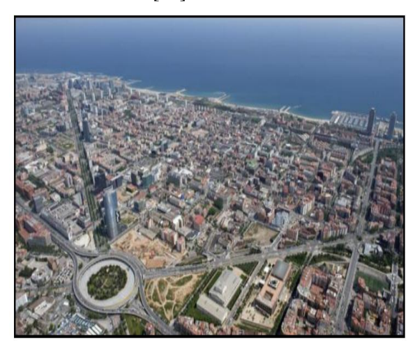
Figure 2. Barcelona urban transformation zone

22@Barcelona, in cooperation with local and national institutions (eg Barcelon Activa, Puerta 22), universities, R & D units, local associations; Barcelona-Poblenou is a transformation project in Spain with an area of 198 hectares, 115 blocks, which was implemented in 2002-2008 to provide industrial heritage protection, urban renewal and economic revival [12].