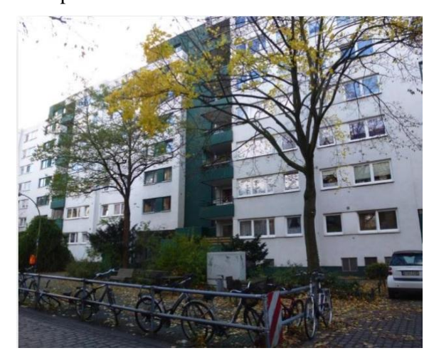
Figure 1. Meyers Hof social housing

Brazil together with Germany, France, England and Spain.