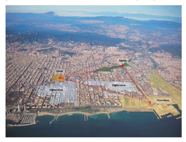
Figure 3. Barcelona urban transformation study

Depending on the specific obligations, the zoning density increase for the private sector (2 to 2.7) and reallocation of the land have been ensured. The establishment of an incentive system for the transformation, payment of the cost of urbanization, the mandatory existence of defined activities, approximately 30% of the land converted area is divided into schools, community centers, aged nursing homes (10%), green areas (10%) and social housing (Figure 3).