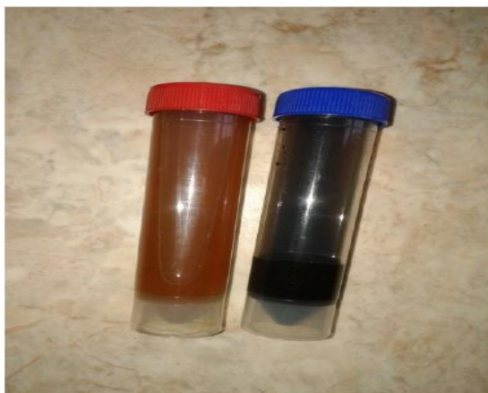
Figure 11. Positive quick test for tannins identification in ethanol extract from a squashed fruiting body of F. robusta.

The color obtained by us resembled the colors of rakiya in which oak chips were applied, or which was kept in oak barrels. Therefore, we decided to check the collected basidiomata for presence of tannins. An ethanolic extract of the fungus was subjected to the Quick Test for Tannins in which 3 ml 10% ferric chloride ( \text{FeCl}_3 ) were added to 3 ml ethanolic extract [8]. According to these authors, formation of blue/black color was a positive indicator for presence of tannins (Fig. 11).