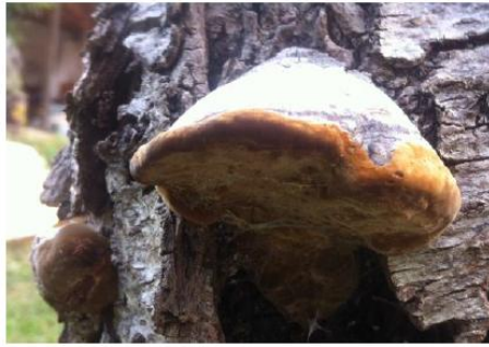
Figure 2. Fruiting bodies of Fomitiporiarobusta from Troyan region.

it seemed much more logical that the fungus we search for should have a Fomes (hoof-like) outfit, which is the mostly used fungus on this purpose in Bulgaria [3]. Almost simultaneously, in the beginning of August 2017, one of the authors of the paper (N.C.) brought three fruiting bodies of the fungus, collected for him by a local producer in Troyan region (but on a plum tree – Fig. 2). Independently, another author (M.S-G) found one