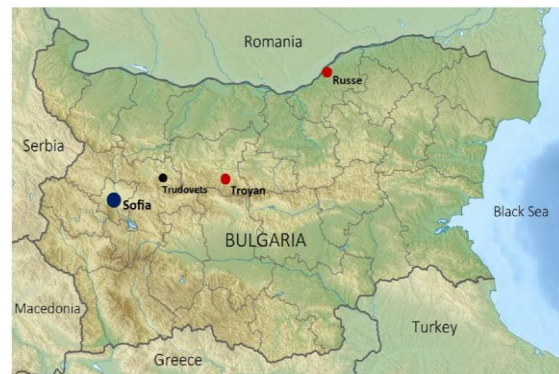
Figure 1. Physical map of Bulgaria where the capital Sofia, the towns Russe and Troyan, and village Trudovets are pointed (after https://www.mapsland.com/maps/europe/bulgaria/large-relief-map-of-bulgaria.jpg ).

“ Morus fungus ” is used for production of rakiya “in mountain regions with colder climate, where the conditions for the wine-cultures are not favorable”, but more details on the regions were not provided.