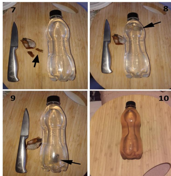
Figures 7–9. Steps of coloration of home produced cherry-plum rakiya by using of small pieces of fruiting bodies (arrows) of F. robustaina small gauze bag. 10. Brandy-brown colored cherry-plum rakiya.

fruiting body of the same fungus on the Morusnigra bark in the vicinity of Trudovets village (Staraplanina Mts.) – Figs. 3, 5, 6. Both fungi were identified (by B. U.) as belonging to the same species Fomitiporiarobusta (P. Karst.)