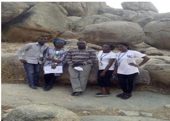
Plate ii. Inselbergs with prominence Dutse, northern Nigeria, 2017

During the later stages a progressively wider area becomes subject to the influence of a single base-level erosion, and at the same time the original mountain masses are related to isolated residual hills (plate i). With the continued decrease of relief and of slope rainfall and action of running water becomes progressively less important (plate v). Depletion removes much of the previous accumulated alluvial infill and abrasion attack an increasing area of bare rock on the desert pene plain, forming a low-level erosion surface.