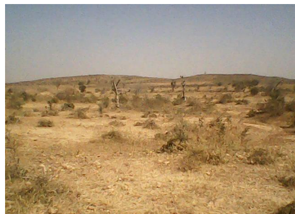
Plate i. Peniplanation/mesas at Anguwan Danbaushie in south Katsina, Katsina State, 2009

This framework of landforms has now largely been dropped out of use because quantitative revolution in Geomorphology that followed with its emphasis on measurements of forms and processes aided by rapidly improving technologies brought about the death of Davisian Model. There are great and infinite varieties of landforms distributions on Earth. They are formed from variety of rock types and multiple of processes and over variable length of time.