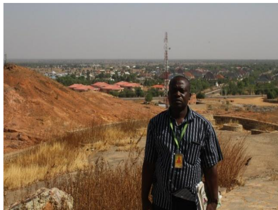
Plate v. Aerial view of Dutse city, Jigawa State Nigeria. This signifies an Evidence of rugged terrain and continuous decrease of relief, 2018.

The Gondwanapeneplain which occurs at a height of 1,200m or more above sea level (asl) is believed to date from Cretaceous times, so called because it is thought to have been formed before the break-up of Gondwana land through Continental Drift. The African Pediplain at 600 meters (approximately 2000 ft) and above is assigned to early Cenozoic (plate ii).