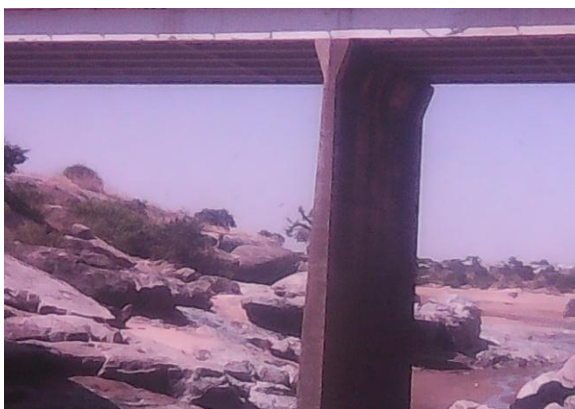
Plate iv. End point of Davisian Cycle, Bungudu side, Zamfara State-Nigeria, 2015