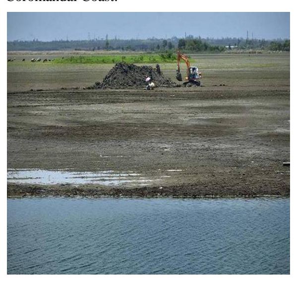
Figure2. Artificial Island initiative by IBF and Aaranyam Foundation in Oussudu Lake

The Forest Department in collaboration with wildlife researchers and conservationists has been intensifying efforts to protect the flora and fauna of the lake, which is home to over 166 bird species and also one of the major sanctuaries for migratory birds on the Coromandal Coast.