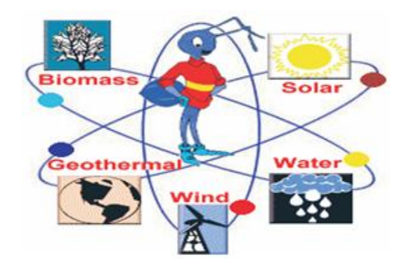
Figure1. Renewable energy resources, diagram obtained bureau of energy efficiency, India

This is power generated by geothermal energy. Technologies in uses include dry steam power stations, flash steam power stations, binary cycle power stations. (Geothermal energy Association, 2010) Geothermal energy is considered a sustainable, renewable source of energy because the heat extraction is small compared with the earths heat content (Rybach 2007)