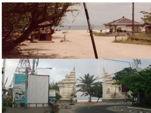
Kuta village during old days

Kuta is a meeting place for global and local influences. Global influence is represented by tourists who come from various parts of the world. While local influences are represented by