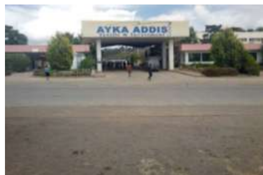
Figure1. Partial photo of Ayka Addis textile and Investment (May, 07, 2019)

For instance, Ayka Addis Textile and Investment created job opportunities for about 10,000 Ethiopians. It also uses raw materials such as cotton from domestic market creating linkage for local economy. Furthermore it benefited the country by generating foreign currency. Partial view of the factory is seen in the following photo that was taken by the researcher during field observation.