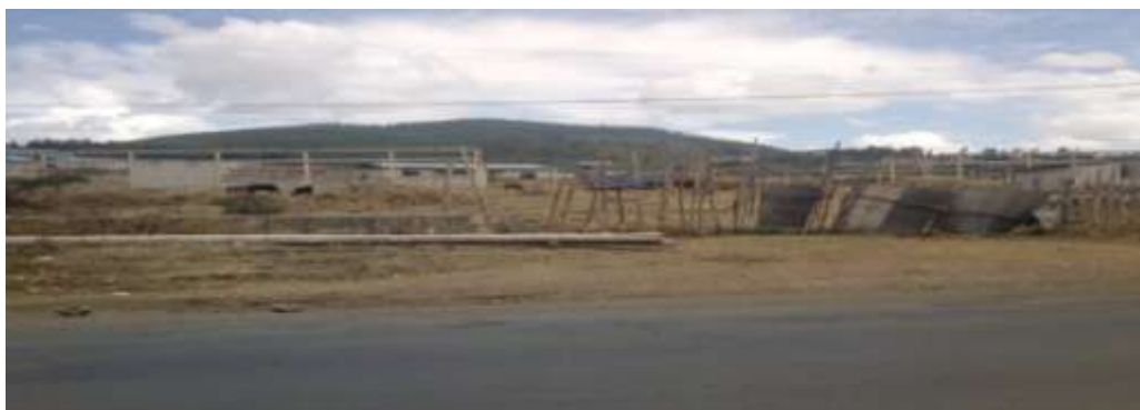
Figure 6. Land taken for investment and simply fended for eight years without expected purpose (Source: Photo taken during field observation on May, 13, 2019).

Displacement tend have negative impacts on livelihood and employment of affected people. With this regard, one participant of focus group discussion with local people addressed how he come to hear for the first time that his land was going to be used for development purpose as follows;