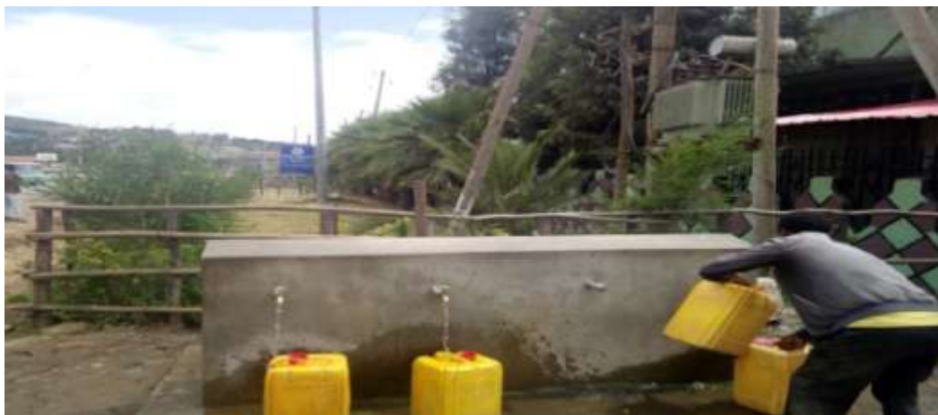
Figure3. Water provided by Best Plastic Factory for public (Source: Picture taken by the researcher during field observation on May, 2019).

The company like (e.g. Best Plastic Factory) is perceived positively by most community members interviewed because of making the local people beneficiaries through providing various services such as pure water, and uses significant proportion of raw materials from local sources.