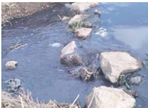
Figure 5. Liquid wastes discharging to the river (Source: Photo taken during field observation on May, 2019).

One of the participant of the focus group discussion said that, “we sometimes use the polluted water for irrigation, we have no another option but it will affect our health, i.e. resulted in itching of our leg and feeling of discomfort on our health. We will farm it when the rain is coming at least it decreases its pollution effect”. According to data obtained from interview with town’s Environmental Protection and Greeneries office, some investment projects became environmental challenges. For instance; Haffede Tannery Industry has been built on the side of the river and Finfinne (Addis Ababa) to Jimma main road. It discharges liquid wastes to the river without proper treatment. Due to this, decision to close taken over it in 2017. However, sister company (garment) inside it still on working