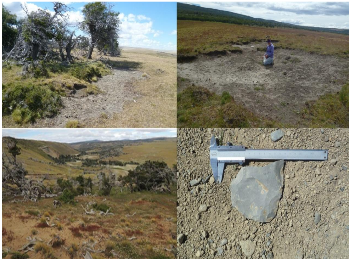
Figure 2. Surface lithic material in the Argentinian stretch of the Guillermo River basin: lithic clusters (above), Cancha Carrera 1 site (left below) and an isolated finding manufactured on lutite (right below).

location within the study area, the kernel density estimate is given by: