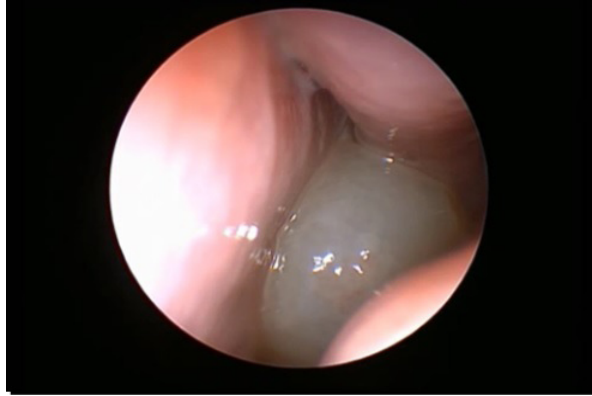
Figure 1. Endoscopic view of the left sphenchoanal polyp has been shown.