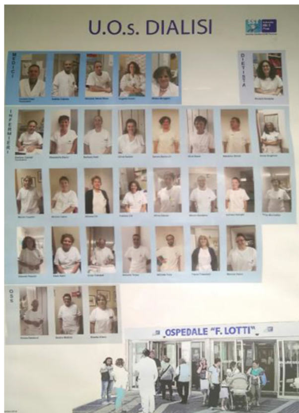
Fig 3. Staff of the UOS of Dialysis of Pontedera (Pisa)

When a disease becomes chronic and serious, it needs demanding and extended therapies but most of all it imposes more intense and deepened relationships between healthcare professional and patient.