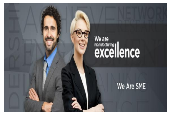
Figure 3. Image-making

Additionally, Kitchen and Moss (2016) remarked that image is drawn from the way an organisation projects itself toward its various publics. In other words, the image is what people think about the organisation based on the impact of its messages. The image is based on both word and deed - on the verbal, visual, and behavioural messages, both planned and unplanned, that come from an organisation and leave an impression (See figure 3).