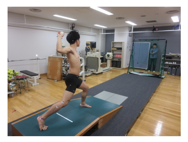
Fig 2. Assessment of the pitching task using VICON and radar gun

non-reflective firm-fitting elastic short pants. Motion data were collected for a total of 10 fastball pitches. Mean values of maximum hip abduction ROM on both sides and hip extension ROM on the trail side were calculated.