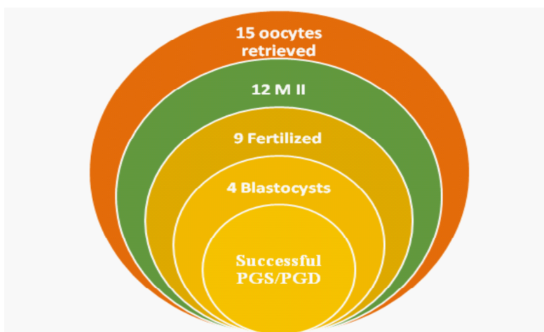
Fig 3. Suggested scheme for success in ICSI+PGS cycles in ideal situations.

metaphase II oocytes, resulting in fertilization of 9 eggs and production of approximately 4 blastocysts, from which 1-2 euploid blastocysts will be available for transfer ( Fig 3 ).