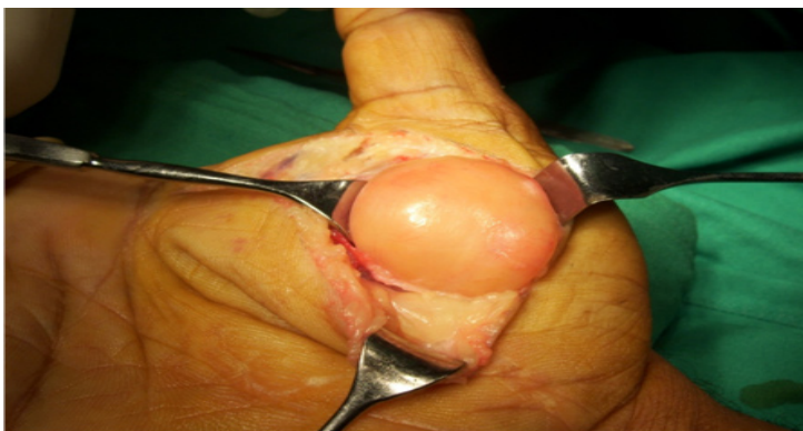
Fig 2. Exposure of the lipomatous tumor