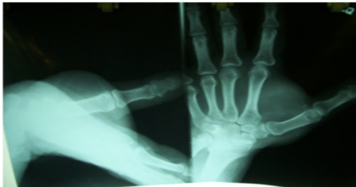
Fig 1. Radiological study of the right hand. Surgical treatment

Hematology: Hb. 12.4 g / l, glycemia. 5.1, coagulogram. normal, creatinine. umol / L, erythro sedimentation. 5 mm / h