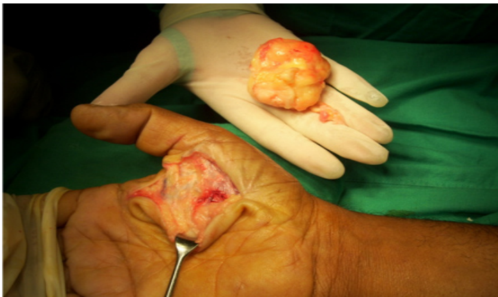
Fig 4. The exeresis of the lipoma is completed