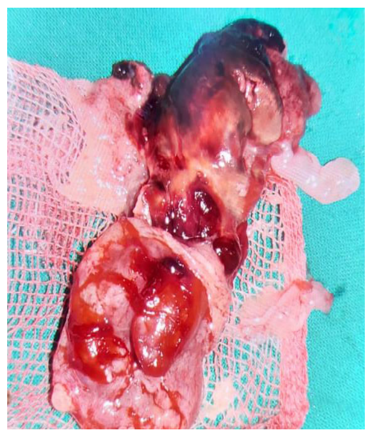
Fig 4. Pathology specimen showing two tubal masses representing two gestational sac in the fimbria of right Fallopian tube (arrow)