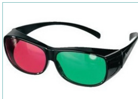
Figure3. Red-Green goggle

(figure3) on the right and left eye respectively the conventional way.