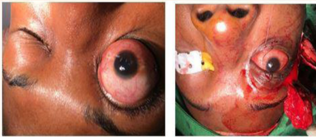
Figure 2a. Right sided uniliateral exophthalmos Figure 2b. peroperative orbital tumor evidence of an intra orbital exophthalmos

The most frequent reason for consultation was exophthalmos, observed in 74 patients that is 93.67%.