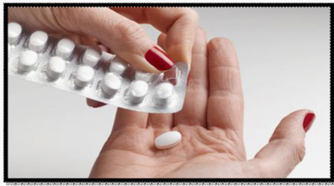
Fig 3. Lasmiditan tablet