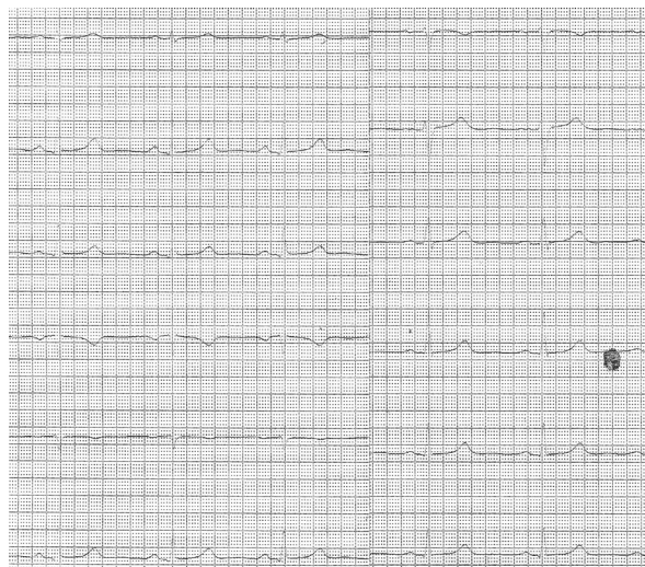
Figure 3. Typical changes in lead aVR and negative T-wave in lead V1 in a phenotype-negative female patient

In lead aVR the amplitude of Q wave was 4mm, the amplitude of R wave 2mm and the amplitude of inverted T waves in lead aVR was 2mm. The amplitude of inverted T-wave in lead V1 was 1mm (figure 3).