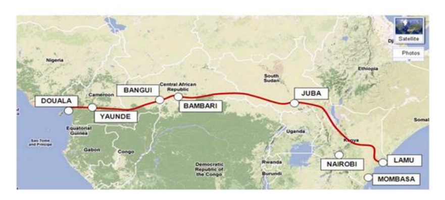
Fig3. The Equatorial Land Bridge