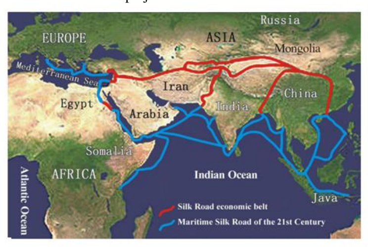
Fig1. The 21st Century New Silk Road

will therefore pass through a number of countries. The Maritime Silk Road (MSR) on the other hand is its oceanic counterpart. This involves the construction of a network of sea ports in the South China Sea, Indian Ocean and the South Pacific Ocean. It will essentially connect South East Asia, Oceania, East Africa and North Africa through the Mediterranean. The core pillars of the initiative are "promotion of policy coordination, facilitating connectivity, unimpeded trade, financial integration people-to-people bonds" (Varlare&Putten, 2015). The African section of the belt and road is of concern for this paper. It covers three countries; Kenya, Djibouti and Egypt.