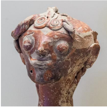
Fig4. Head of a clay wheel-made idol from the Cult Center at Mycenae, c. 13 th century B.C., the Archaeological Museum of Nafplion (photo by the author).

century B.C. (Taylour 1983, 52-53), and the Dodonian figurine head, even considering the difference in size (the idols' heads are about 10-12cm) and that, unlike the head from Dodona, the clay idols from Mycenae are wheel-made and hollow. It might seem to someone that the small terracotta head found in Dodona was a kind of local provincial miniature imitation of large clay cult figures from the “cultural capital” of the Mycenaean world.