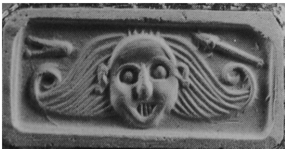
Fig5. Representation on a Middle Minoan prism seal, Ashmolean Museum, Oxford (no.1938.794).

The Dodonian head's most striking feature, which is unparalleled in the Minoan and Mycenaean terracotta figurines and figures discovered so far, is its wide-open mouth with either a stuck-out tongue or projecting tusk(s). In Greek historic iconography, these were the characteristic traits of Gorgon, whose secure representations in sculpture, relief, and vase painting are known from the early-seventh century B.C. (Krauskopf 1988, 289). However, the origins of the image of Gorgon seems to have been connected with the Minoan religious ideas: for example, a Middle Minoan cornelian prism seal stored in the Ashmolean Museum (Oxford) bears on one side representation of a human-like head with bulging eyes in large deep orbits and wide-open mouth, in which long, hardly human teeth are visible (Fig.5; Hughes-Brock, Boardman 2009, 235, no.101a).