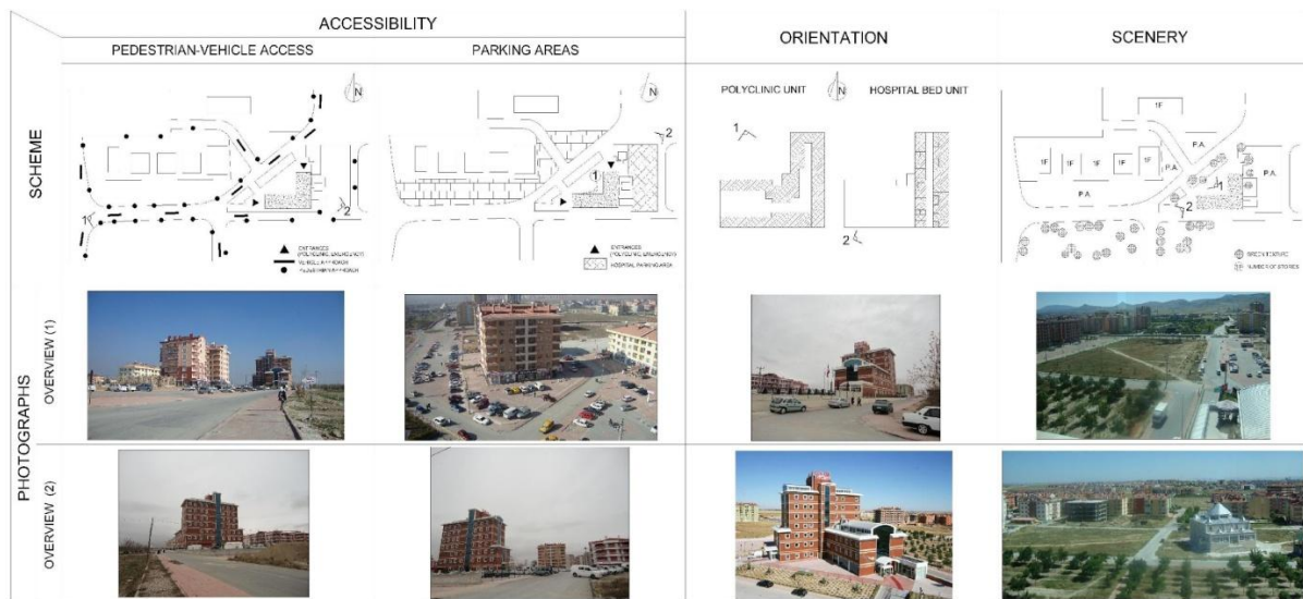
Table 5. The natural and physical environmental characteristics of the Private Farabi Hospital