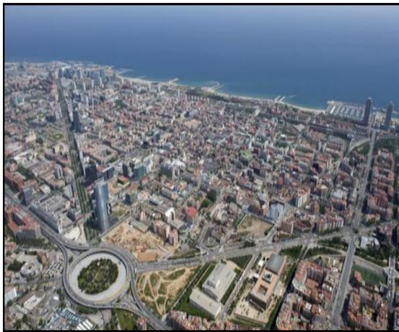
Figure2. Barcelona urban transformation zone

22@Barcelona, in cooperation with local and national institutions (eg Barcelon Activa, Puerta 22), universities, R & D units, local associations; Barcelona-Poblenou is a transformation project in Spain with an area of 198 hectares, 115 blocks, which was implemented in 2002-2008 to provide industrial heritage protection, urban renewal and economic revival [12].