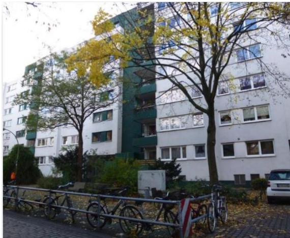
Figure 1. Meyers Hof social housing

Brazil together with Germany, France, England and Spain.