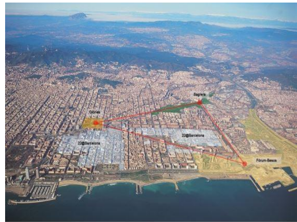
Figure3. Barcelona urban transformation study

Depending on the specific obligations, the zoning density increase for the private sector (2 to 2.7) and reallocation of the land have been ensured. The establishment of an incentive system for the transformation, payment of the cost of urbanization, the mandatory existence of defined activities, approximately 30% of the land converted area is divided into schools, community centers, aged nursing homes (10%), green areas (10%) and social housing (Figure 3).