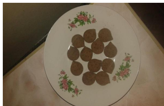
Plate 3. Biscuits produced from 100% cocoyam ( Xanthosoma sagittifolium cv okoriko) flour.

Xanthosoma sagittifolium cv okoriko could be a good raw material for biscuit production.