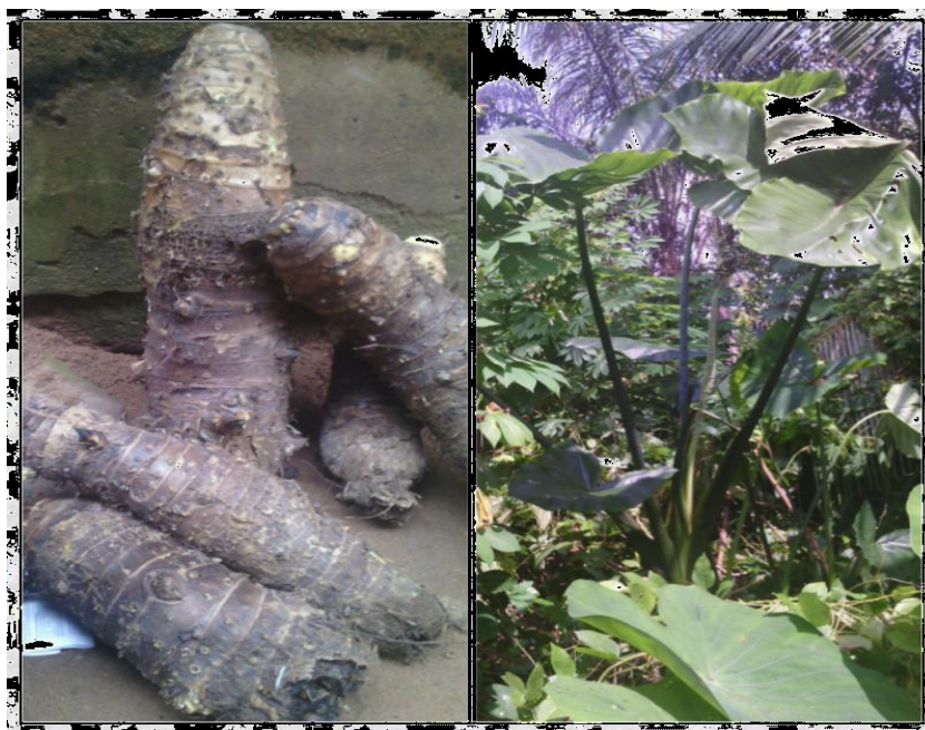
Plate1. Cocoyam ( Xanthosoma sagittifolium cv okoriko) corms and Plant.