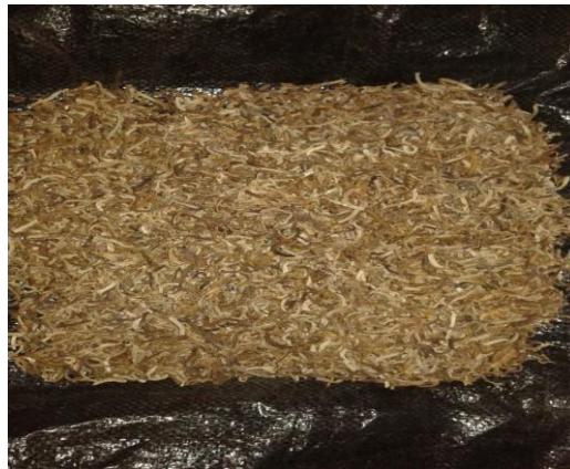
Plate2. Shredded and dried Cocoyam ( Xanthosoma sagittifolium cv okoriko ). Production of biscuit

The processed cocoyam ( Xanthosoma sagittifolium cv okoriko ) flour was used for biscuit production using standard recipes. Ingredients used are stated in Table 1.