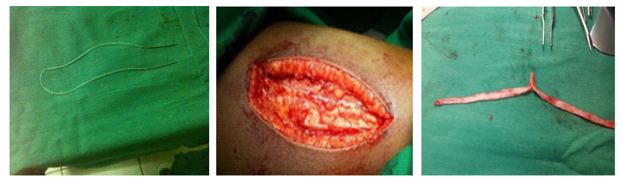
Figure 2. Equipment for frontal suspension: ptosis probe (A), fascia lata sampling site (B), Fascia lata (C).

Among the surgical techniques, frontal suspension was the most performed in 64.71% of cases followed by resection of the levator muscle of the upper eyelid in 23.53% of cases. Fascia surgery was performed in only 11.76% of cases (figure 2,3).